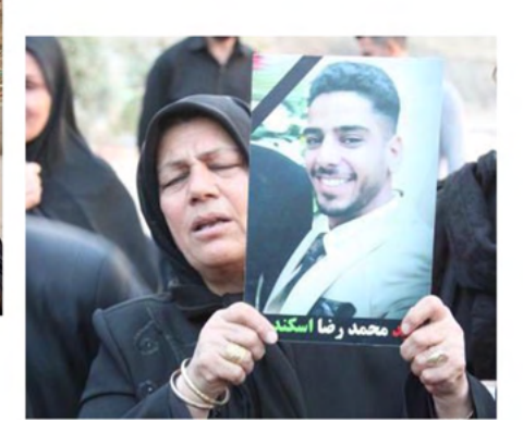
Grieving mothers of those killed in protest crackdowns in September 2022 (published June 11, 2023).