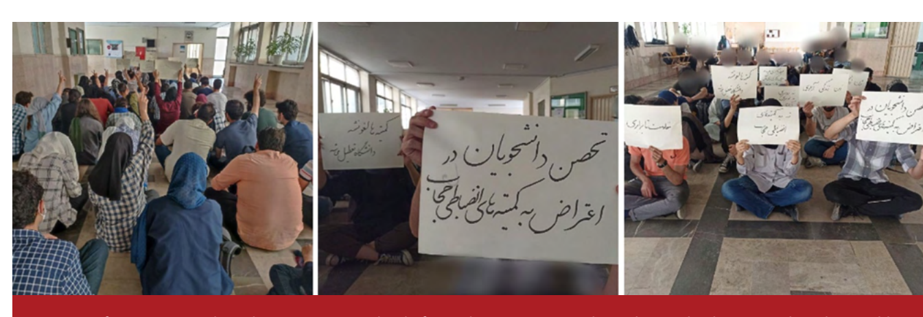
Scenes from a sit-in at the Tehran University School of Social Sciences, posted to Telegram by the National Student Guild Councils on May 9

Despite the crackdown on protesters and clear signals and warnings, including from the Supreme Leader, that the state will not concede on the mandatory veil issue, many women and girls seem to have engaged in a war of attrition against the state and its discriminatory law.<sup>83</sup> In the face of the ongoing challenge of "improperly veiled" and unveiled women, the authorities are taking deterrence measures such as fines, installation of cameras, and threats of prosecution for those who encourage unveiling.<sup>84</sup> They also seem to have turned their attention to students. In universities, close to 150 of which played an active role in the nationwide 2022 protests, students are