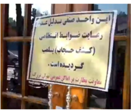
Authorities close a place of business in Iran owing to women's failure to abide by the mandatory hijab law there (published June 21, 2023).