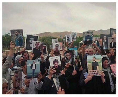
Protesters who lost loved ones in protest crackdowns gather to demand accountability in Saqqez on June 9, 2023.