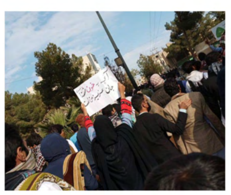
Protesters gather in Zahedan. One holds a sign reading: "What you've washed in blood is the life of my dear one." Published June 14, 2023.