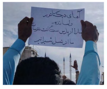
A protester in Zahedan, Baluchestan signals resolve: "Mr. Helpless Dictator: Don't scare us with your dog barks, we are lions" (published January 3, 2023.) Since Zahedan's Bloody Friday on September 30, 2022, protesters in that city held recurring demonstrations every Friday.