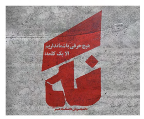
Protest graphic in support of art students from at least 17 universities who had, as of June 19, joined a campaign to boycott their course tests: "We have nothing to say to you except one word: NO!" (published June 19, 2023)