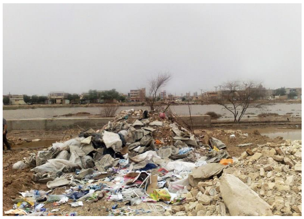
◎↑ Piles of rubbish at the mass grave site in Ahvaz.