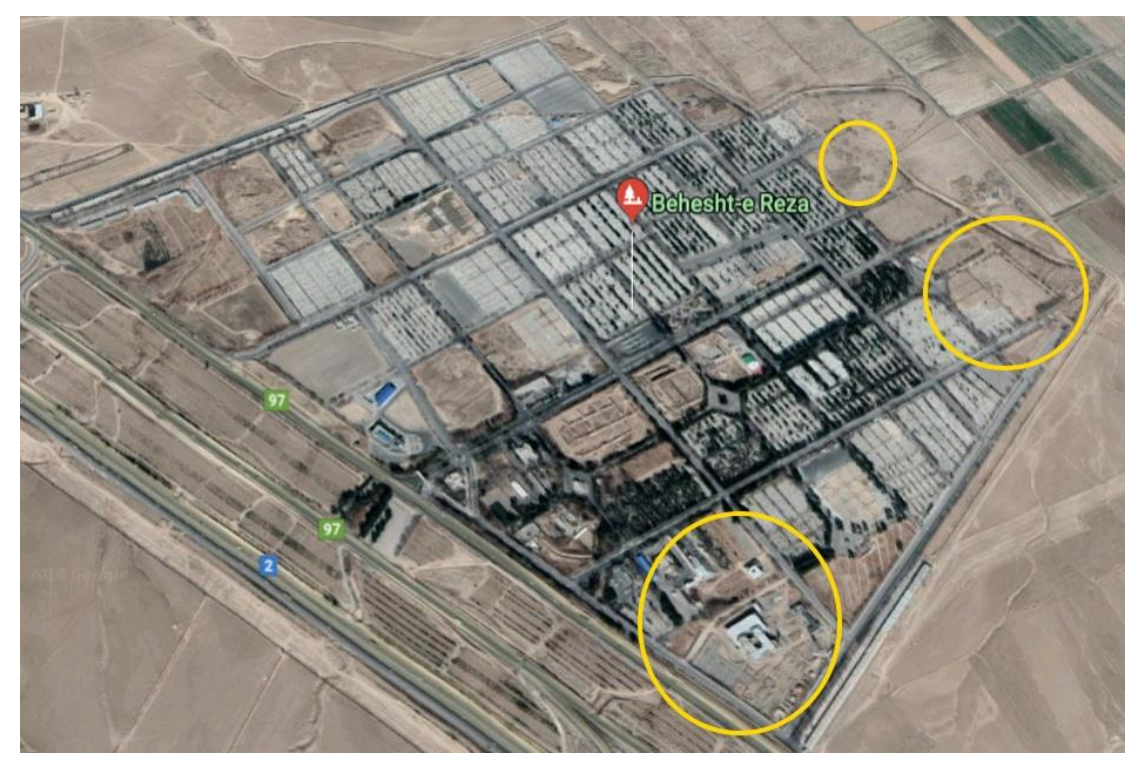
The yellow circles indicate the reported locations of three mass grave sites on the edges of Behesht Reza cemetery in Mashhad: (clockwise from top) on its eastern side, in its south-eastern corner and in its southern corner.

Over the past three decades, the Iranian authorities have deployed various abusive techniques in order to prevent families from holding commemorative gatherings or decorating these mass grave sites with memorial messages. Amnesty International and Justice for Iran understand that they have consistently destroyed the memorial signs and stones erected by the families, installed security cameras in the area to instil fear, and occasionally directed water over the mass grave sites to create flooding.