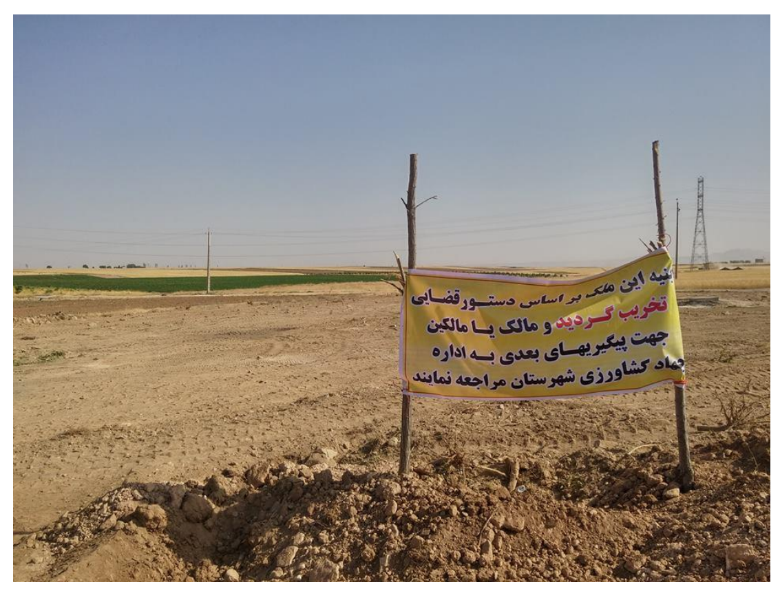
The scene left after the individual graves of victims of the 1988 prison killings in Qorveh were destroyed by bulldozers in July 2016. The banner states that the destruction was undertaken pursuant to a judicial order.

Satellite imageries obtained by Justice for Iran and Amnesty International between 1 May 2014 and 3 October 2016 confirm that the grave site has been destroyed.