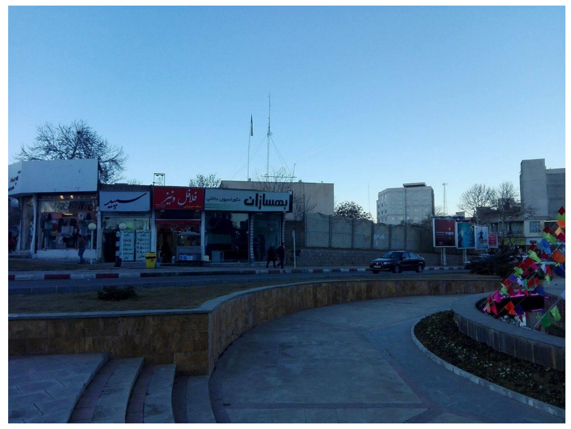
The mass grave discovered in June 2003 in Sanandaj is believed to have been disguised underneath the area in which the black car is parked, in Shahrdari Square.

Today, the former location of the mass grave forms part of the area around Shahrdari Square, which is one of the most crowded places in the city of Sanandaj, due to the shopping facilities there.