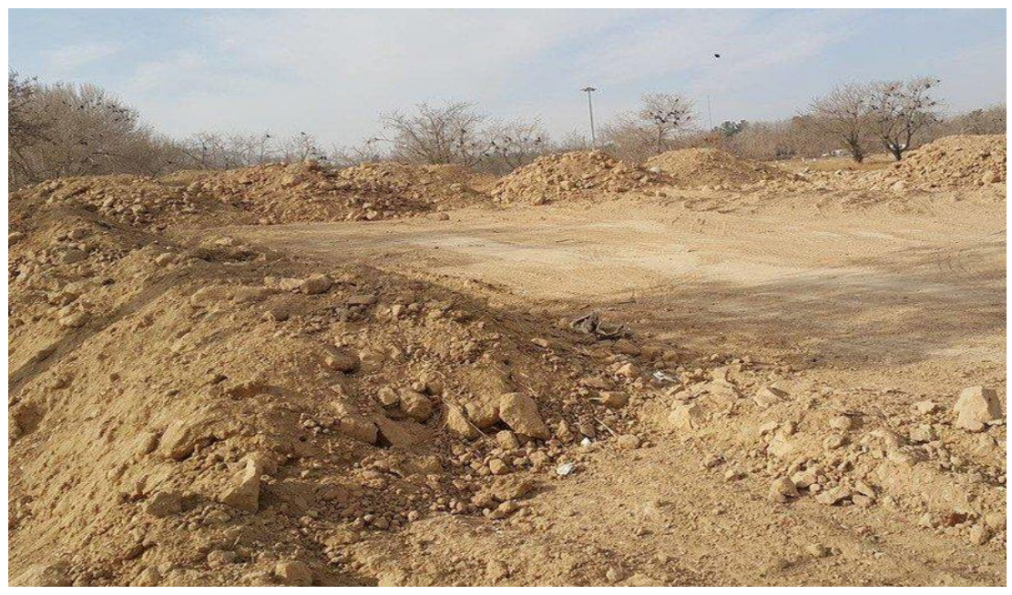
Mounds of soil covering parts of the mass grave site located in the south-eastern corner of Behesht Reza cemetery, confirming eyewitness reports from March 2017.

In March 2017, one part of this area which was previously flat was partly covered with mounds of soil, as seen in the picture below. Eyewitnesses have since told Amnesty International and Justice for Iran that the authorities are constructing new burial plots over the site.