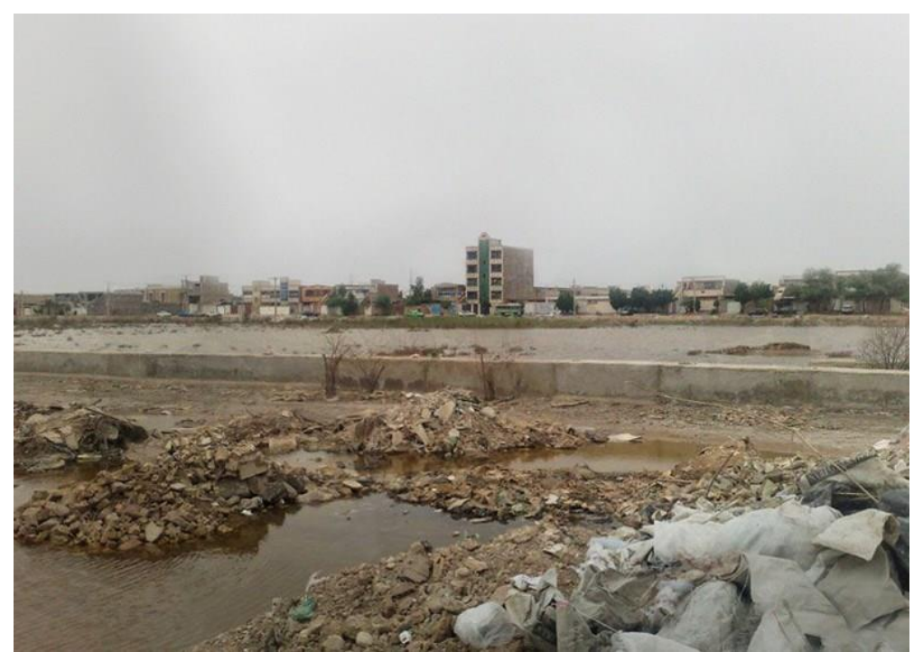
The site of a mass grave in a barren piece of land 3km east of Behesht Abad cemetery in Ahvaz. The location of the remains is believed to be beneath the concrete slab in the foreground.

August 1988.<sup>4</sup> Families believe that the authorities poured concrete over the mass grave immediately after the burial in order to prevent families from digging up the ground and recovering the bodies of their loved ones.