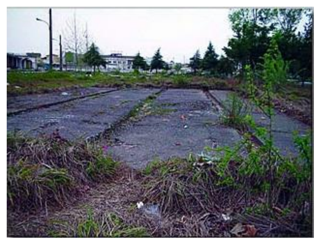
The suspected mass grave site in Tazeh Abad cemetery before new individual burial plots were developed in 2008.

Justice for Iran interviewed a family member who had talked to several owners of the new burial plots and reported that they consistently said that the authorities had not informed them about the mass graves lying beneath the plots they had bought.