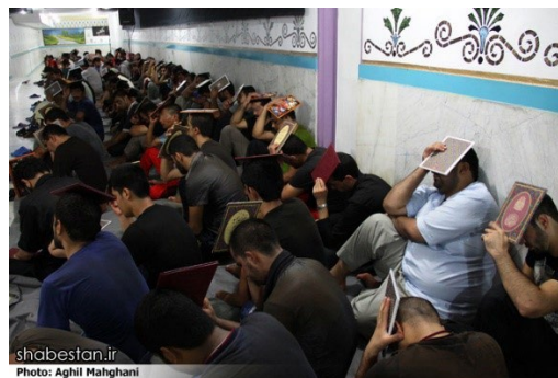
Amirabad Prison, Gorgan, July 2014

The family member of an inmate at Amirabad Prison (Gorgan County, Golestan Province) reports that new prisoners have been introduced into the population amid the pandemic despite a lack of preventative supplies like masks, gloves, and disinfectant at the facility. Two individuals displaying COVID-19 symptoms were released into the prison's prayer room in close proximity to other prisoners, rather than being transferred to hospitals and given appropriate medical care. 56