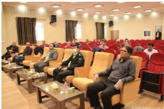
Hamedan Prison officials, March 18

transparency are the country's only arms against the pandemic. Iran can and must do more to ensure the health of prison inmates and staff.