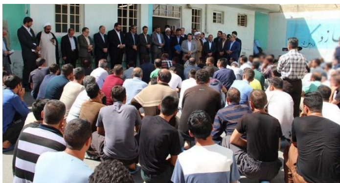
A Parliamentarian Visits Orumieh Central Prison September 4, 2018

The Orumieh Prison Women's ward is isolated: though there are cameras in all the rooms, the guards' quarters are 10 minutes away, making it difficult to get their attention in an emergency. The Ward holds about 150-160 prisoners divided among four rooms, where about 40 inmates sleep on three-tiered bunk beds and make do with only two showers and two toilets. One of these rooms, Room 4, hosts prisoners suffering from addiction (the majority of women held in Orumieh, according to ABC's source, are imprisoned for addiction or other drug-related charges). Food provided by the prisons is of particularly poor quality. The ward gets a doctor's visit once a day between 11 a.m. and noon; a nurse and midwife are present in the examination room an hour before. The medical team is poorly equipped, and inmates rarely get a proper examination.