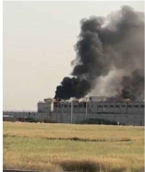
Ahwaz Central Prison Telegram Channel @SepehrAzadi, April 1, 2020

The spread of COVID-19 in the Islamic Republic of Iran has recently led to fear and unrest in prisons across the country and claimed the lives of several prisoners. 1 The pandemic has made all the more urgent concerns that have been repeatedly raised by human rights organizations, 2 including Abdorrahman Boroumand Center for Human Rights in Iran (ABC) , 3 over overcrowding, poor hygiene and nutrition, and the prevalence of disease in the country's prisons. Enclosed living spaces, along with prisoners' weakened immune systems, facilitate the spread of the deadly virus. The World Health Organization (WHO) and other experts 4 have stressed the importance of preventive measures and provided guidelines to limit the spread, both within prisons and from prisons to the community at large. 5 Iran's judiciary has taken some welcome steps to curb the proliferation of the virus in prisons, including the temporary release of thousands of prisoners. 6 However, ABC research into several prisons reveals that preventive measures have been inadequate and inconsistently implemented. The scope of coronavirus transmission within the prison system is unknown and Iranian officials refuse to provide the public with data. Improving prison conditions requires significant structural reform and time. In the short term, serious political will and