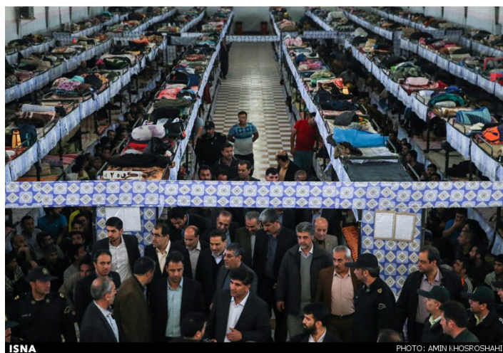
Visit of Minister of Health to Karaj Central Prison, 2015

Hot water access is limited to one hour in some wards, while other wards get two hours. A small, low-quality piece of soap, a small shampoo, and two cups of washing powder — enough to last about two weeks — are distributed to inmates once every two to three months. According to one source, there are three doctors in the prison clinic taking turns working 24-hour shifts. Information about disease prevention and management consists of posters with instructions on handwashing on the wall behind the guards’ desk at the entrance of the ward. Prisoners can comply by washing their hands with dishwashing liquid available in the bathrooms. A source with knowledge of another ward reports that there is not enough soap for regular handwashing and that additional cleaning products have not been distributed, commenting, “they tell us to wash our hands regularly, but with what?” 42