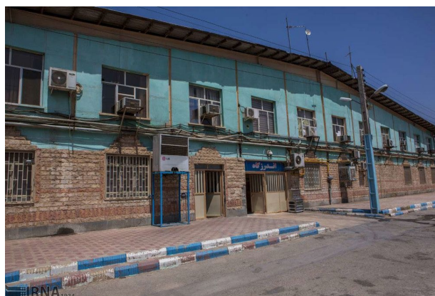
Qarchak Women's Prison IRNA

At Qarchak women's prison (Varamin, Tehran Province), there are 11 wards, two dedicated to drug offenders and two to prisoners convicted of violent crimes. The prison is notorious for its lack of hygiene, nutritious food, and medical care. Each ward, reportedly meant to hold 100, holds almost twice that number. There are 12 restrooms and 10 showers for each ward, several of which are broken or unusable for lack of water. Hot water is available one hour in the morning and one hour in the evening. The prison water is not drinkable, forcing prisoners