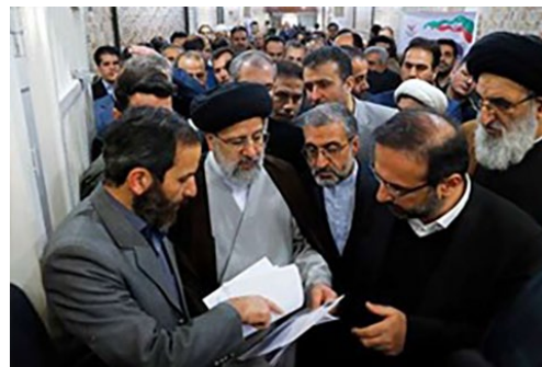
Chief Justice Visiting Karaj Central Prison January 2, 2020