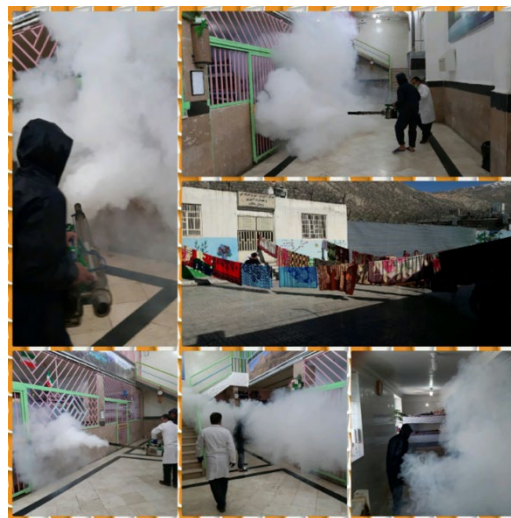
Disinfection measures at Ilam Prison

In Ilam Prison (Ilam Province), social distancing is not an option. The Salamat ward (Ward 1) holds about 40 people, with one shower and two toilets to be shared by them all. Ward 2 has about 40 beds to sleep 130 inmates who double up on single mattresses or sleep on the floor. Prison authorities did not appear to take the pandemic's hazards seriously. The process of releasing prisoners has been extremely slow. Though some prisoners with lighter sentences have been released, many of those prisoners eligible for leave are still in prison due in part to the absence of relevant officials. No effort has been made to raise awareness among prisoners about the coronavirus, and as of mid-March, guards were not wearing masks or gloves when circulating among the wards. 50