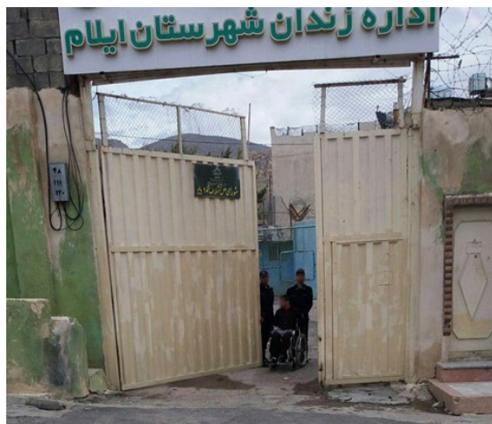
Ilam Prison

Hygiene at Ilam Prison is substandard. Though prisoners have access to hot water, limited quantities of soap are provided for handwashing and general cleaning needs. Inmates who cannot afford their own soap sometimes have no choice but to rinse their hands with water only. Prison authorities have not provided additional soap or disinfecting products to help protect inmates against the new viral threat. In the past several weeks, ABC's source has seen only one instance of a chlorine-smelling disinfectant mixture being sprayed in the wards and between beds. There is no visible monitoring of prisoner health from prison guards or medical staff, and many