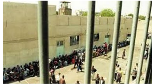
Prisoners hiding from the sun, Hormozgan Prison Dolphine News, June 30, 2019

In many prisons, overcrowding makes social distancing physically impossible. Measures to raise awareness among prisoners have been insufficient and inconsistent, and prisoners’ hygiene is gravely inadequate to protect prisoners from a pandemic. Eyewitness reports collected by ABC and reports from other sources indicate substandard conditions exacerbated by the COVID-19 crisis, as well as mounting anxiety and fear among prisoners.