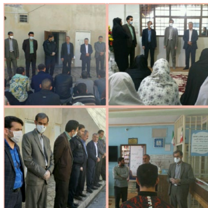
COVID-19 awareness raising at Ilam Prison Official Website of Ilam Prisons

The continued lack of attention to prison conditions endangers the lives of inmates as COVID-19 runs rampant across the country. No significant resources seem to have been dedicated to protecting prisoners during the pandemic. Though some measures have been taken in several prisons, 21 six weeks after the official acknowledgement of the COVID-19 crisis, the judiciary's directives have been ignored and/or inconsistently and arbitrarily implemented in many prisons.