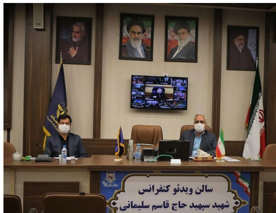
Teleconference of Prison Officials, March 30, 2020 Official Website of Kerman Prisons

Historically, however, rhetoric on improving prison conditions has not been met by resource allocation, serious monitoring of implementation, or accountability. Mass incarceration — a product of decades of highly punitive laws and sentencing practices 12 — has combined with corruption, incompetence, and lack of resources to create a hazardous environment for inmates.