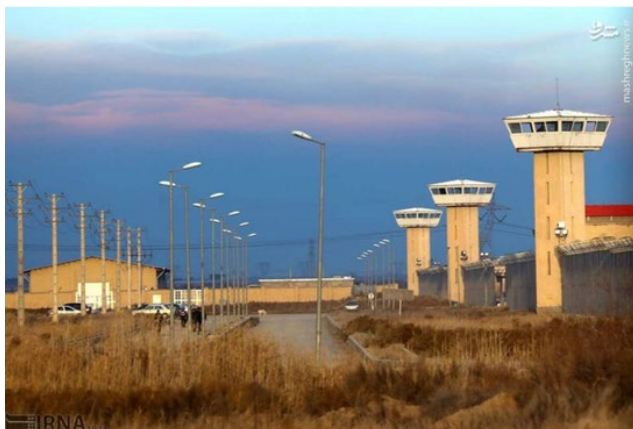
Greater Tehran Prison

In the Greater Tehran Penitentiary, where many cases of infectious diseases such as tuberculosis, meningitis, and hepatitis have been reported, the official approach seems to be more security- than health-oriented, and little information has been provided to prisoners about the disease. The prison remains too crowded to allow for proper social distancing: in late 2019 in Building 4, Ward 2, approximately 1,500 prisoners were divided in three rooms. Each room was equipped with only 14 toilets and showers to accommodate the 400 to 500 people it hosted. Hot water was made available one hour per day, sometime between 4 and 6 a.m. There is no self-serve source of drinking water. Personal cleaning products (soap, shampoo, washing powder) are distributed every few months, and in such small quantities that prisoners with more financial means buy their own supplies and donate their rations to cellmates in need.