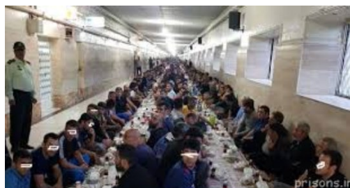
Iftar at Karaj Central Prison Iran Prisons Organization

Tuberculosis and meningitis are common in Greater Tehran, increasing inmates’ vulnerability to other infectious diseases. In late January/early February, a room in Ward 4 was quarantined for about 350 inmates with tuberculosis. Vaccines have also been distributed for meningitis, but in too limited quantities, according to ABC’s source, to protect all prisoners. After the pandemic was announced in late February, medical staff in at least one building were provided with protective clothing, which was removed only a few hours later on orders from prison security officials who said the gear would provoke fear among inmates. Consequently, clinic staff working there make do with only masks and gloves. In Building 1, a room has been quarantined for prisoners believed to be infected with coronavirus. Yet, on April 4, five prisoners suspected of being infected were found in Room 5, Building 2 of the same prison. The room in question, which was holding 200 prisoners, was immediately quarantined. 39 ABC does not have information about the fate of those in quarantine.