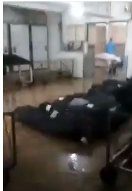
Footage of Qom morgue widely circulated on social media. The individual who recorded this footage, shedding light on the scope of the crisis at its epicenter, was later arrested.

Despite exceptional releases over the past few weeks, prisons remain overcrowded. The decision, announced in a statement by the judiciary's Human Rights Council, 24 not to send convicts to prison until April 20, is not fully implemented either. State agents continue to send people to prisons and detention centers for addiction, minor offenses, or ostensibly political crimes such as reporting about the spread of the virus and its victims. On March 3, an individual who had recorded video of dozens of bodies inside a morgue in Qom was taken into custody after the video was widely distributed on social media. 25 On March 14, Tehran's Police Chief announced the arrest of 27 people for "spreading rumors" about the coronavirus. 26 On April 2, the Iranian Cyber Police arrested civil society activist Amir Chamani in Tabriz after summoning him on unknown charges. 27 In the first week of March 2020, authorities announced the arrest of hundreds of drug users, 407 in Hormozgan Province. 28 On April 3, the police chief in eastern Tehran Province said 111 people had been arrested in a raid of a "norm-breaking" mixed-sex private party in Sharyar. 29