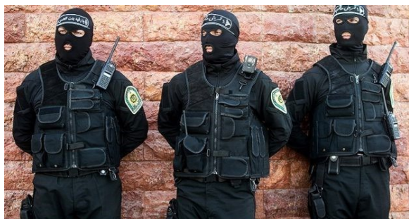
Officers of NAJA, the Law Enforcement Force Official Website of Lorestan Prisons